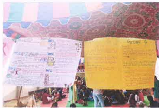
Awareness Song- Practice and Composing