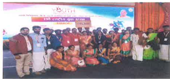
Tamil Nadu Contingent