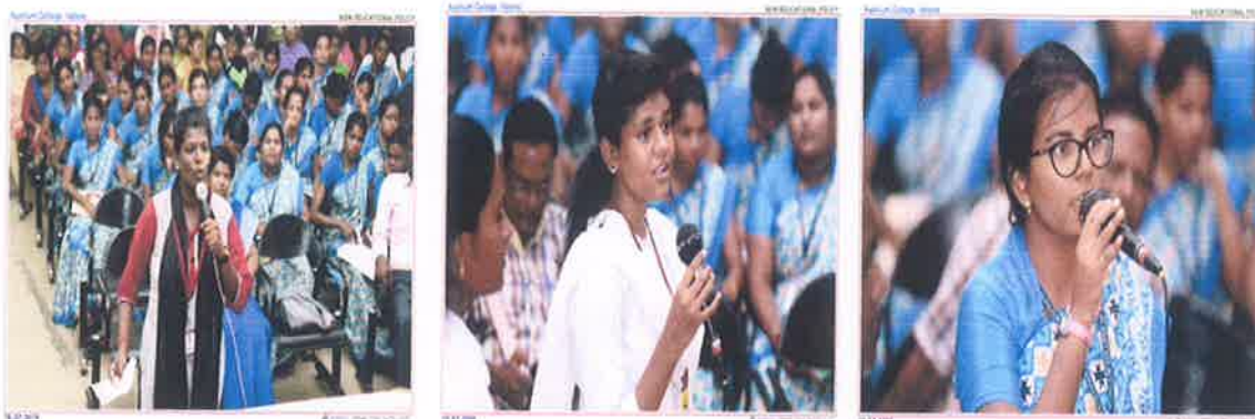
Student's interaction on New National Educational Policy