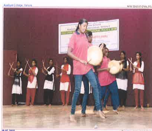
Street Theatre- AICUF Volunteers