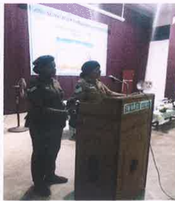
Awareness on SOS App