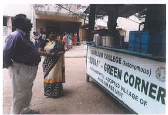
NSS Regional Director visiting the NSS Green corner