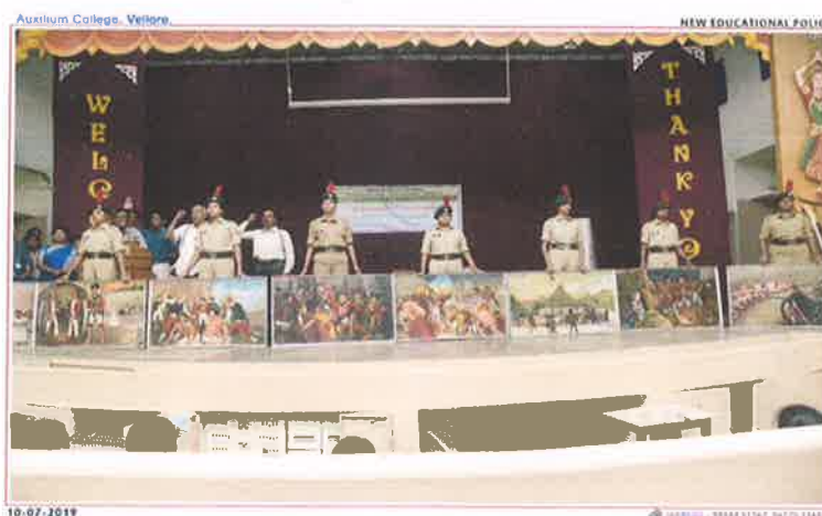
Tribute to the vellore Sepoy Revolt Soliders