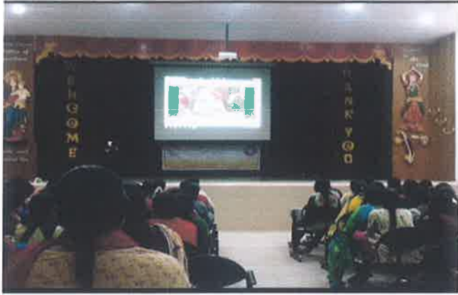
Prime Minister's live address on Constitutional Day