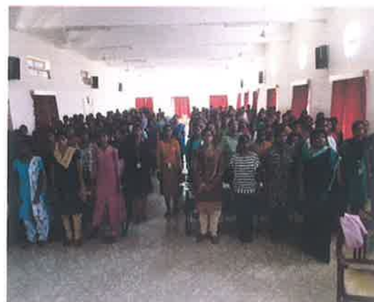
NSS Volunteers watching the Live telecast of the launching event of Fit India Movement by the Honourable Prime Minister of India.