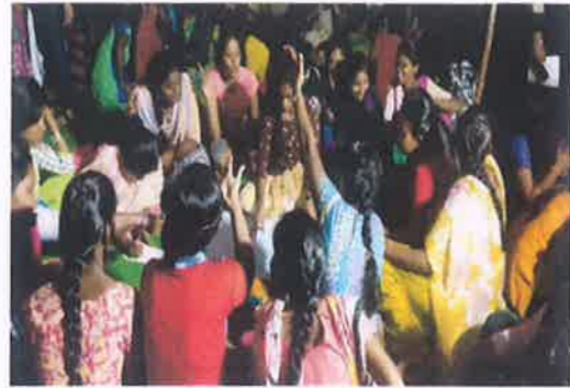
Group Discussion and Village Mapping